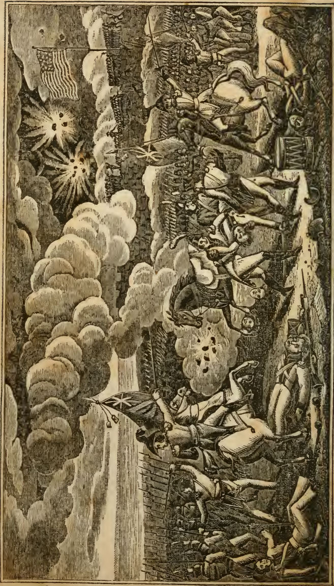
BATTLE OF NEW ORLEANS.....GENERAL JACKSON.